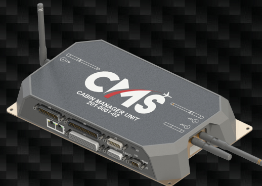
Cabin Management Unit 201-0001-02