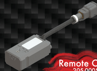
Remote Control 205-0005-02