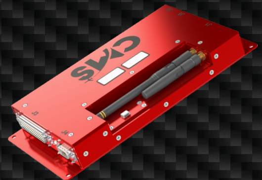
Cabin Management Unit CR 201-0005-01